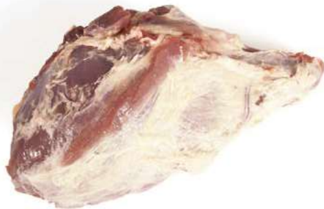
4 Thick Flank.