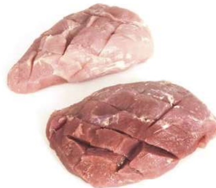
5 All the featured leg muscles when trimmed of excess fat and gristle can be cut into portions of required weight and scored to create Pork Chunkies.